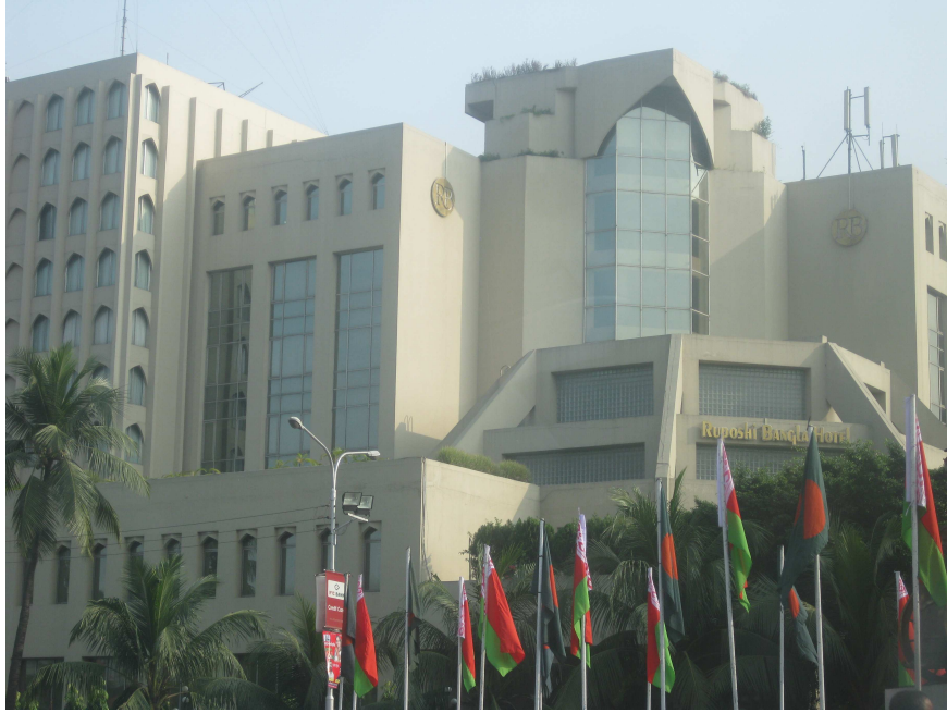
Ruposhi Bangla Hotel, Dhaka, Bangladesh