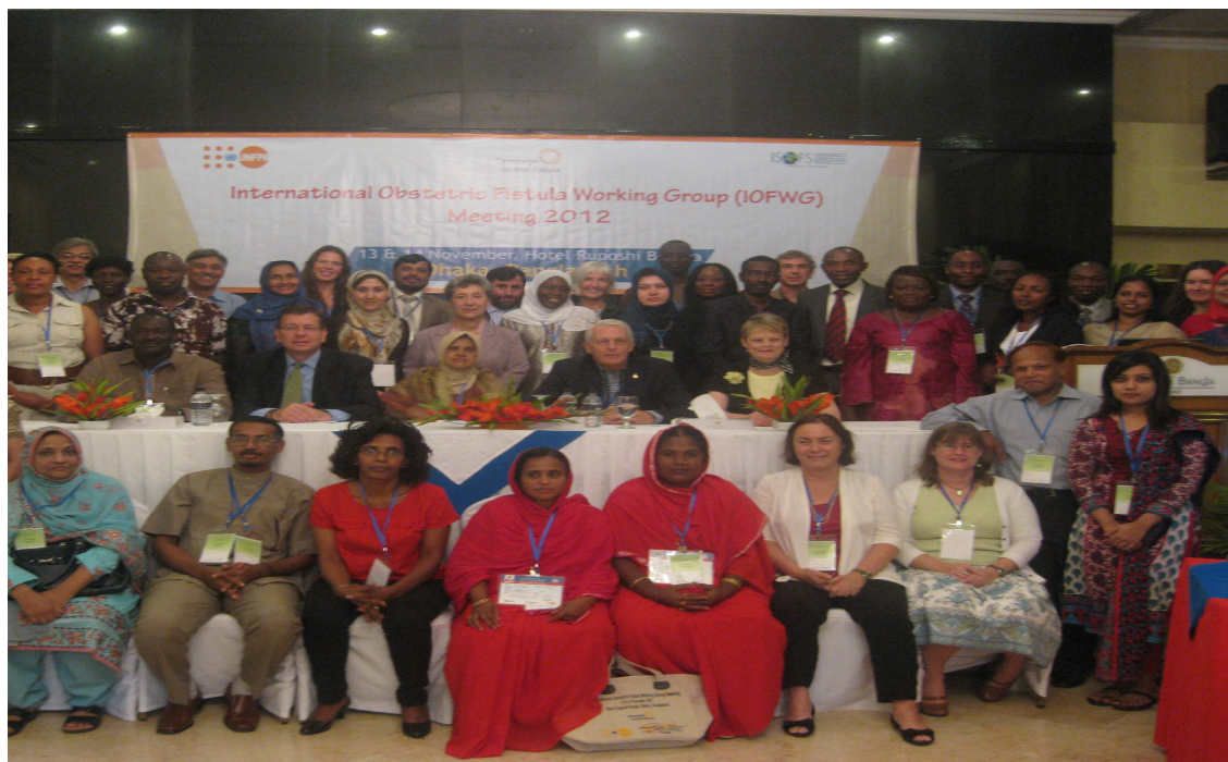
Photo de Famille en compagnie de 2 anciennes patientes de fistules en rouge