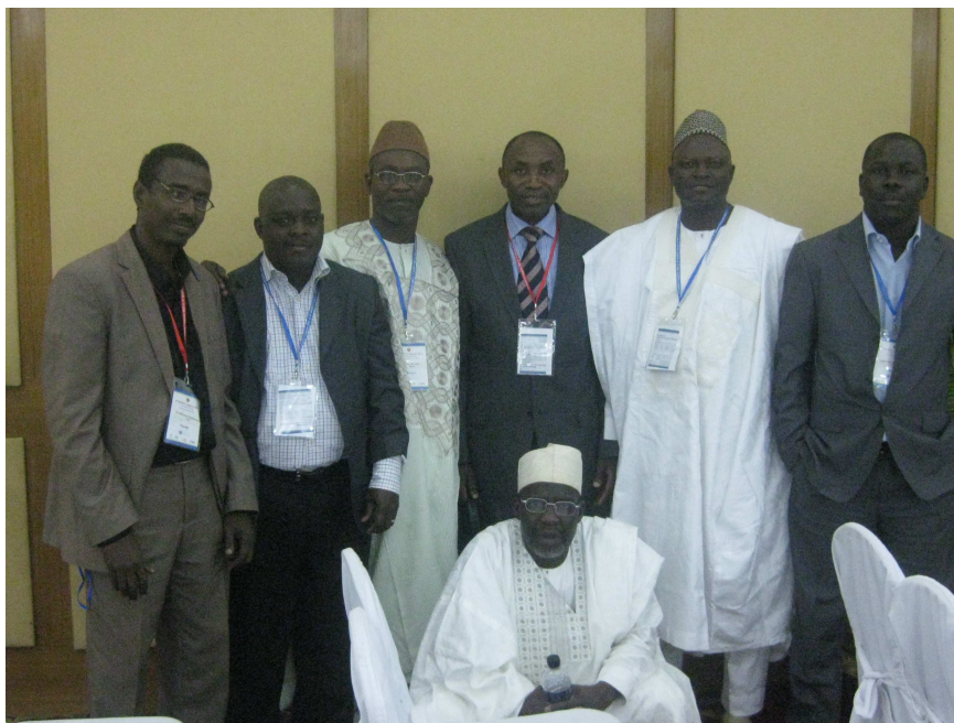
Une recontre avec un groupe des africain du Sud du Sahara