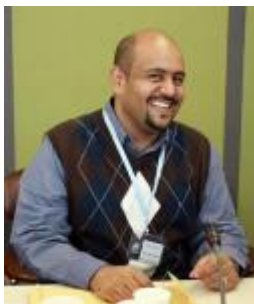
Sudan - Khalifa Elmusharaf