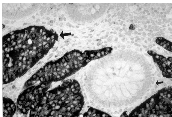
Figure 2. Chromogranin stain demonstrates strong positive staining of tumor cells (larger arrow), and surrounding a non-neoplastic mucosal gland (smaller arrow).

with appendicitis; the rest of the abdominal and pelvic organs were normal. CT of the chest was normal. She underwent a laparoscopic appendectomy. The appendix was inflamed and revealed a carcinoid tumor breaking through the mucosa.