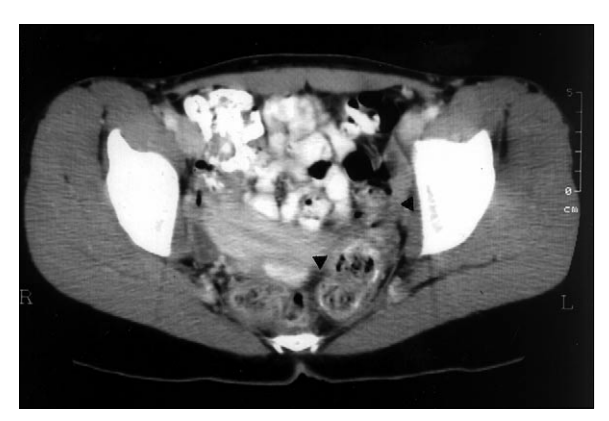
Figure 2. CT scan of the pelvis showing a normal right ovary (arrow), absent left ovary, and a unicornuate uterus with absent left endometrial canal (arrow).