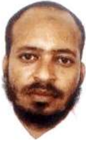
Osman Abbass Ministry of Health, Khartoum State