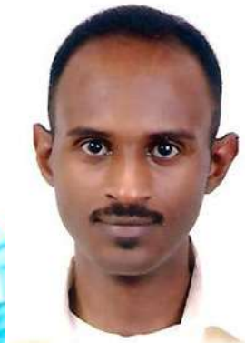
Husameldin Musa Federal Ministry of Health