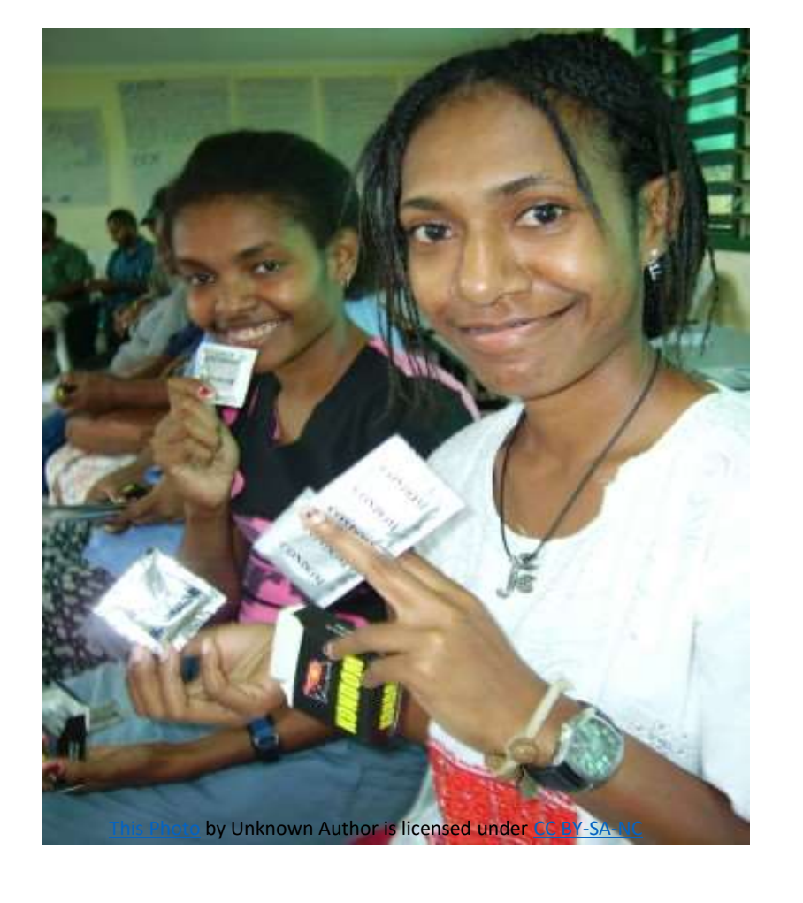
Analytical Framework for Financing SRH Services